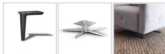
PM2050 PM2051 PM2054