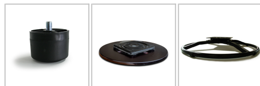
P633 PL1014 PM2053