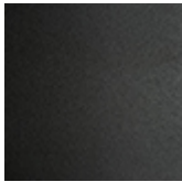
GF69 embossed graphite