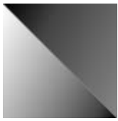
satin iron grey