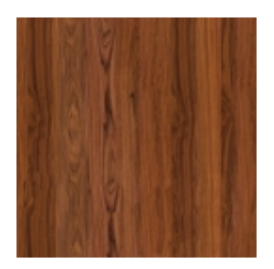
Solid wood American walnut

Materials, fabrics, leathers, colors and finishes are approximate and may slightly differ from actual ones. You can find the complete collection of Bonaldo fabrics and leathers on the website <a href="https://bonaldo.biz">https://bonaldo.biz</a>