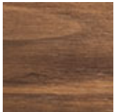
NC walnut canaletto