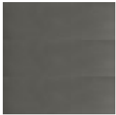
OP0 transparent varnished