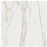
OD05 matt Golden Calacatta