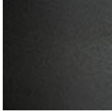
GFM69 graphite embossed