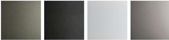
GFM11 titanium embossed