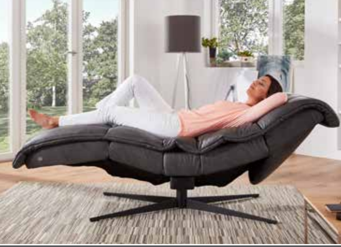
adjustment of leg rest, seat inclination and headrest to a horizontal sleeping position