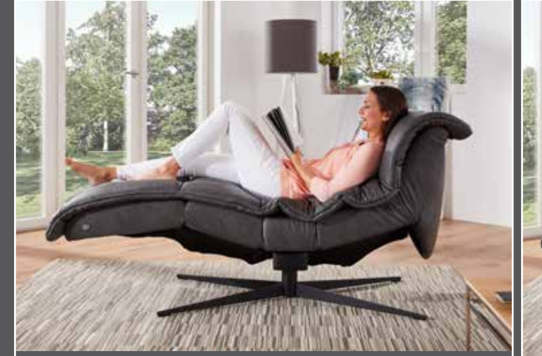
electric adjustment to a relaxed sitting position