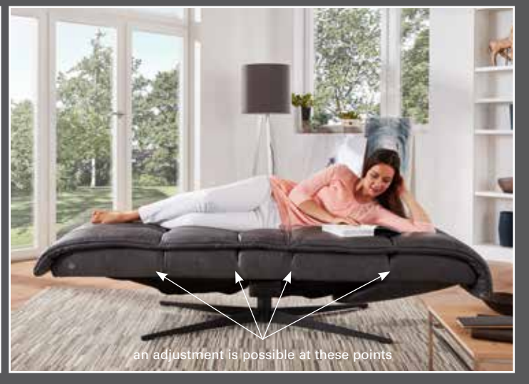
with 4 motors, any desired position can be set effortlessly