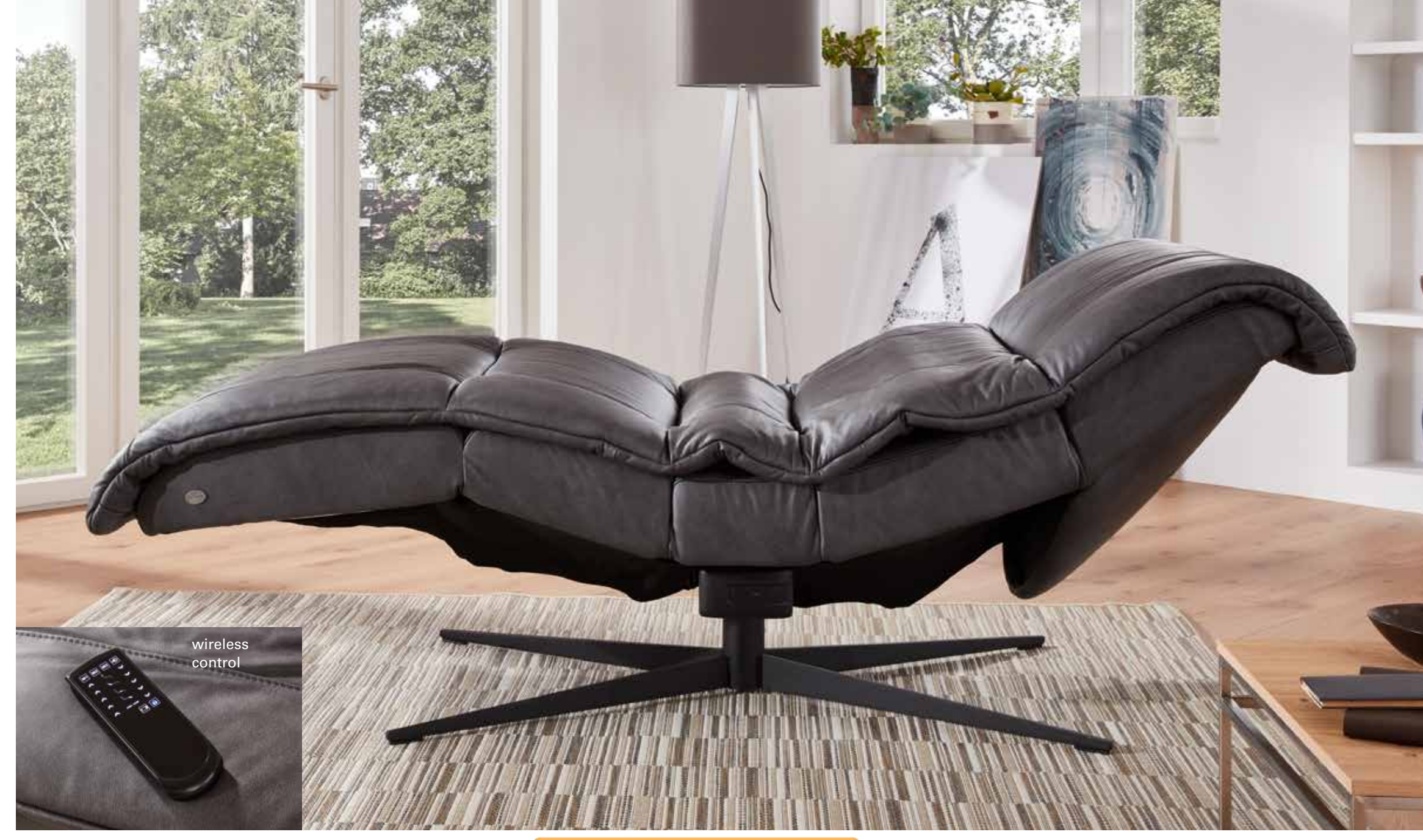
Composition: 30 R (base 63 anthracite)